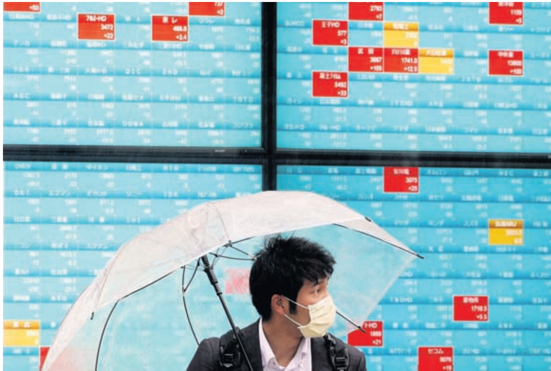
A man with a protective mask stands in the rain in front of an electronic stock board showing Japan's Nikkei 225 index at a securities firm in Tokyo Monday, April 13, 2020.

"Wall Street is encouraged simply by the conversation of a reopening of the econ-